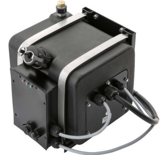
Mini Fuel Additive Applicator - 5 L

Optional Extras include: Stainless Steel tank, GSM Cellular Modem, Remote Switches & LEDs, Heater for cold climates, Solenoid Valves for extra fuel tanks, Keypad Display Unit for tanks with no fuel level sensor, Fuel Tank Vent Adaptors, Teflon Additive Tubing, Laptop Null Modem Cable, Applicator Tank Dipsticks, plus Dry or Wet Demonstration Units.