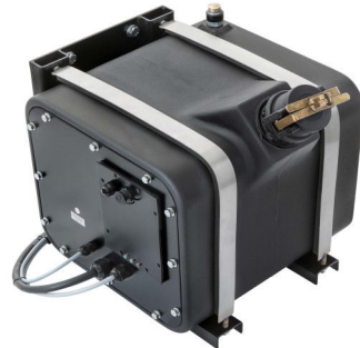
Maxi Fuel Additive Applicator - 20 L

FULLY AUTOMATIC NO DRIVER INPUT REQUIRED ACCURATE DOSING COMPENSATES FOR AFFECT OF TEMPERATURE ON ADDITIVE VISCOSITY SET ANY ADDITIVE DOSING RATIO DURABLE CONSTRUCTION EASY INSTALLATION OPTIONAL STAINLESS STEEL TANK FOR MINI FAA